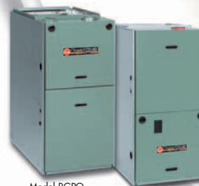
Model RGPQ Upflow/Horizontal